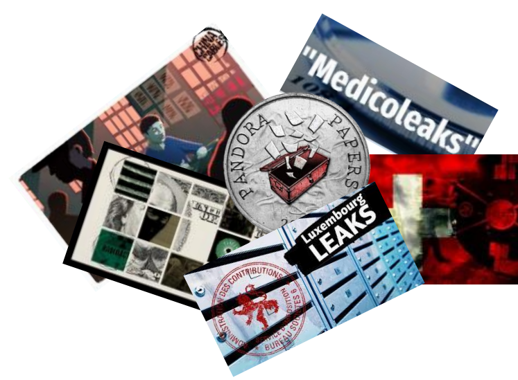
Illustrations: Wikileaks (Iran War logs, Guantanamo Files, NSA world spying, ...) "China cables", Pandora Papers, Swiss Leaks, Luxleaks, Medicoleaks, ...